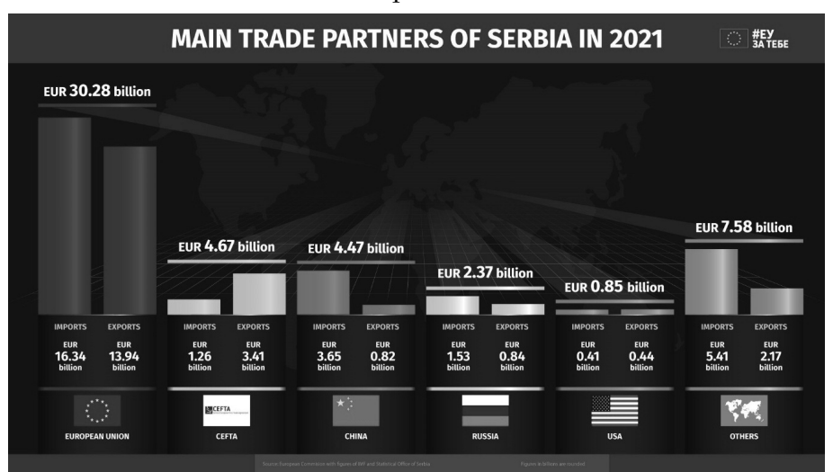
Table 1 - Main trade partners of Serbia in 2021

The analysis of Panel 1 clearly shows that the EU is Serbia's most important foreign trade partner. From 2009, when that trade amounted to 3.2 billion, in 2021 it reached 14 billion. This fact indicates that the export of the Serbian economy to the EU is increasing, but this is not the case with China and Russia. As can be concluded, there is an obvious imbalance, especially with China. Analyzing Table 1, it is concluded that Serbia's exports to China are 0.82 billion, and imports from China are 3.65 billion. Also, there is an obvious imbalance with Russia. Imports from Russia are 1.53 billion, and exports are 0.84 billion. The National Bank of Serbia has published the balance sheet of FDI in Serbia. According to the attached data for 2021, the People's Republic of China did not have FDI in Serbia. Russia had 6.3 billion while the EU convincingly had the highest FDI of 116.4 billion (Narodna banka Srbije, 2022).